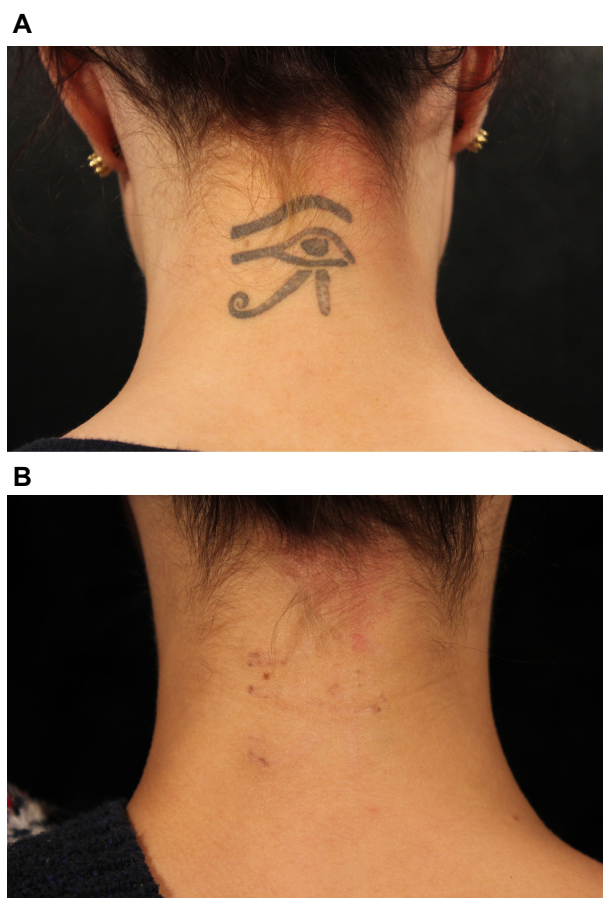
Figure 3 Professional tattoo before (A) and after third picosecond Nd:YAG laser treatment (B).

Effective tattoo removal necessitates the use of an appropriate wavelength that is preferentially absorbed by the specific ink color within the tattoo. 102 Black pigment absorbs wavelengths from red through the infrared spectrum