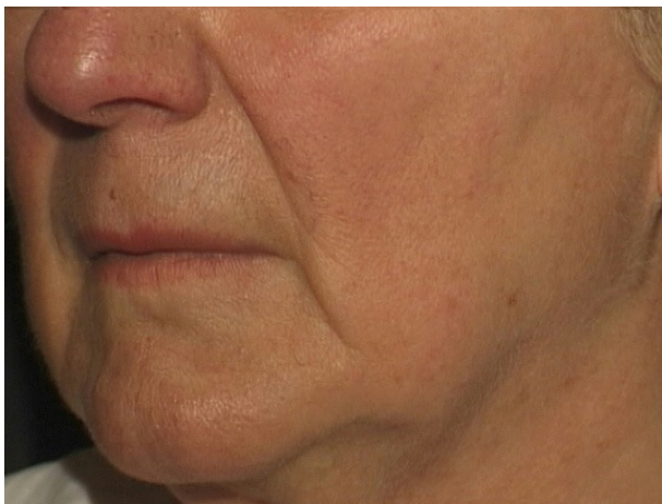
Figure 1 Facial erythema and prominent telangiectasias in a patient with rosacea before (A) and after two 595 nm pulsed dye laser (PDL) treatments (B).

effective for leg veins and is considered the gold standard treatment; however, it can be associated with significant adverse effects such as ulceration, allergic reactions, and telangiectatic matting. 53,54 The KTP and PDL lasers as well as IPL have shown efficacy in the treatment of small vessels measuring <1 mm. 55-57 The treatment of larger and/or deeper vessels requires longer wavelengths and pulse durations. The LP alexandrite (755 nm), diode (800 nm), and Nd:YAG (1,064 nm) lasers have each been successful in eradicating small- to medium-sized veins. 57-59