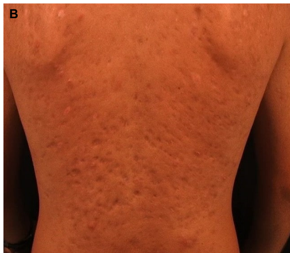
Figure 5 Severe atrophic acne scars on the back of a young man before (A) and 6 months after one ablative fractionated carbon dioxide (CO 2 ) laser treatment (B).

occur. Patients often encounter posttreatment erythema and edema following nonablative fractional resurfacing that typically resolve within 3 days. 176 Erythema that extends beyond 4 days is considered prolonged and is reported in <1% of patients. In contrast, erythema that lasts beyond 1 month following ablative fractional laser treatment is considered prolonged and is seen in ~12.5% of patients. 177 A 590 nm light-emitting diode system has been shown to reduce post-fractional laser erythema. 178 Herpes simplex virus infection is the most common infectious complication following fractionated laser treatment, affecting up to 2% of patients. 177 It is generally recommended to treat patients prophylactically if they have a history of facial herpes simplex virus or if perioral laser treatment is performed. Bacterial infection is comparatively low with an incidence of 0.1%. 177 Antibacterial prophylaxis can be useful prior to ablative fractionated laser resurfacing. In addition, transient acneiform eruptions can